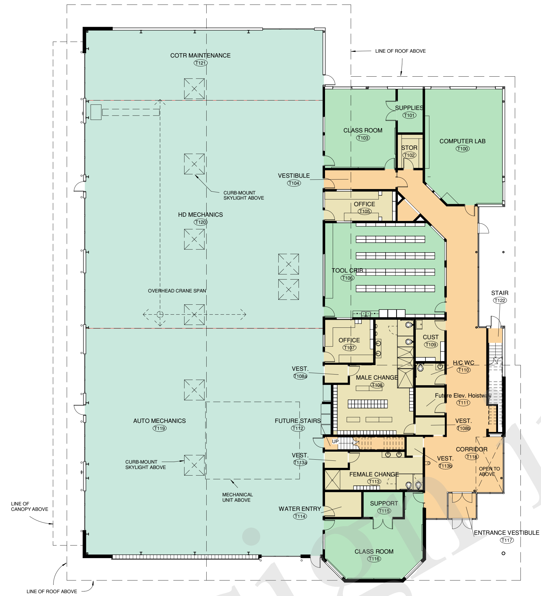
1 PRESENTATION TRADES - MAIN FLOOR A400T 1 : 200